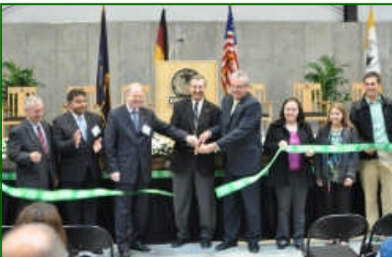
Ribbon Cutting Ceremony during the Grand Opening on May 18th 2011

The Opportunity for utilizing Biogas in the United States to generate Energy is tremendous