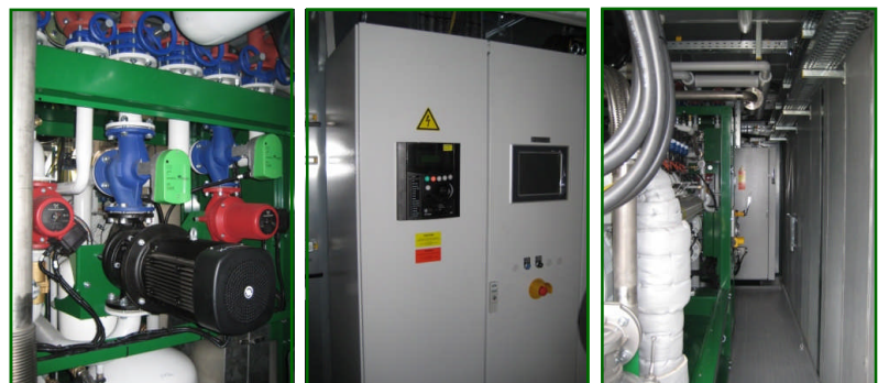
Inside View, complete and "connection-ready" The 2G ® CHP Cogeneration Module

Making technology selection decisions are certainly the most important tasks of a project manager, and often very difficult. Using various decision criteria, different types of information, analysis of alternatives and choices, as well as considering long-term objectives all guide purchase decision-making. For the University of Wisconsin, Oshkosh, and BIOFerm™ the decision to select a 2G-CENERGY ® system was obvious. It's the most cost-effective quality solution, truly "Best In Class", and by far the most economical CHP cogeneration technology available in the U.S. No other supplier comes close to 2G ® 's experience, know-how, quality, and with more than 1500 plants installed, 2G ® has an unmatched track-record to prove it like nobody else in the market.