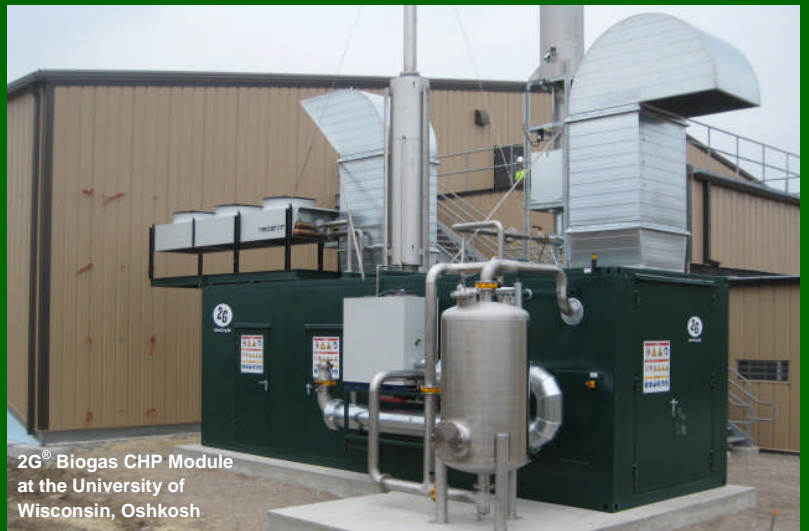
2G ® Biogas CHP Module at the University of Wisconsin, Oshkosh

The dedication of the very first high solids dry fermentation anaerobic digester (HSAD) took place on May 18, 2011 at the University of Wisconsin Oshkosh. It will be the first biogas plant using this technology to go on-line, not only in the United States, but in all of the Americas. The facility, owned by the University, is designed and constructed by BIO-Ferm™ Energy Systems, a member of the German Viessmann Group, an international leader in renewable energy. Commercial-scale dry fermentation technology is capable of using numerous waste streams and eliminates the need for additional liquid or movement of input. A dry fermentation anaerobic biodigester harnesses and enhances the natural decomposition process and creates valuable biogas for energy production.