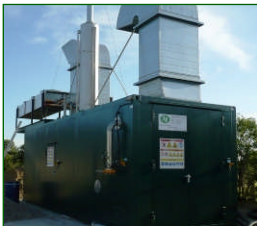
The 2G® Plug & Play CHP Solution

The scope of supply includes utility grid inter-connection switchgear, and the gas treatment technology. A 2G® biogas optimized MAN® prime mover is fully integrated in this modular "plug & play" power station. The biogas dehumidification system, a H 2 S (hydrogen sulfide) removal technology package, and the emergency flare are all integral parts of the power plant. RES decided to purchase a modern and advanced modular plant, instead of the conventional custom design-build gas genset configuration they experienced for other projects in the past. The plant is an integrated package,