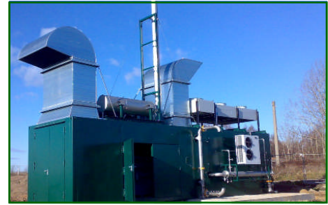
2G® CHP Container Module

Furmano Foods Inc. in Northumberland, Pennsylvania, is expanding the company's wastewater treatment plant to use methane gas through the processing of organic waste to generate electricity and supply a portion of the facilities energy needs. ADI® Systems Inc., a leader in biological treatment systems for industrial wastewater plants, was selected to implement their advanced anaerobic treatment technology. ADI® decided to purchase a fully containerized 2G-CENERGY® biogas CHP cogeneration module, including gas treatment, interconnection switchgear, and emissions control technology. This plant will generate 2,075 MW/h electricity, and 9,800 MMBTU of thermal energy per year. ADI® is one of the worlds leading industrial wastewater treatment