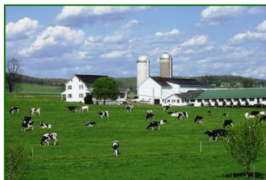
Dairy Farms can produce clean Energy

2G-CENERGY® is installing this 100% connection-ready modular power station in Aug. 2011.