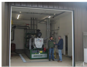
The 2G Start-Up Team and the Van Dyk Plant Owners