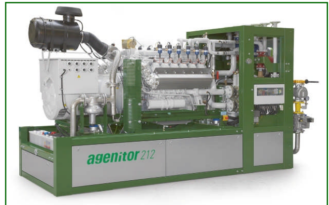
The 2G agenitor ® 212 for The Matt Brewing Company

EMG (Environmental Management Group Intl. Inc.), selected 2G-CENERGY® to supply a high efficiency biogas CHP for the Matt Brewing Company wastewater treatment project in Utica, New York. This leading edge 400ekW/h biogas CHP module provides the brewery with an electrical efficiency of 39.10% and 1,934,684 BTU/h thermal energy. The prime mover is a 2G® agenitor ® 212, the