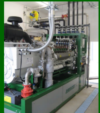
The 2G agenitor ® 212 at the Van Dyk Farm

tial due diligence, including visiting various German biogas plants, they quickly discovered that the majority of biogas plants operating in the U.S., in the size range <1000ekW, are underperforming. Especially in reference to biogas CHP's they realized that not only the engine makes a difference, but that most importantly the overall CHP cogeneration plant design determines success or failure. Using fractional factorial designs, as they can be found at many of the roughly 150 agricultural biogas plants in the U.S., wasn't the solution for this project. Consequently they decided to select a technology that is proven, highly efficient, reliable, and truly "Best-In-Class".